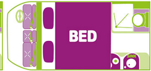
FLOOR PLAN NIGHT (LOWER LEVEL)