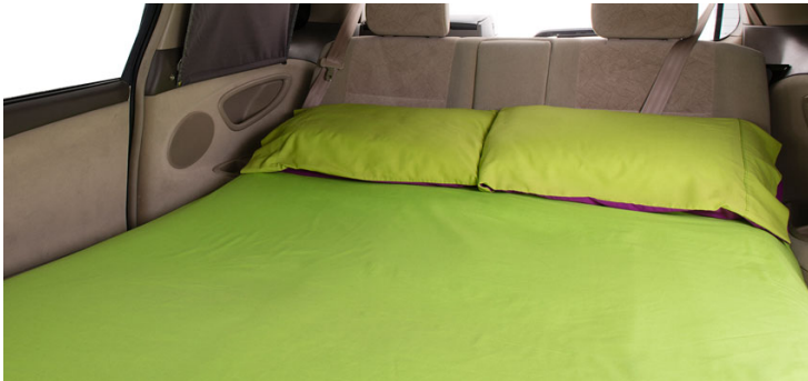
FLOOR PLAN DAY