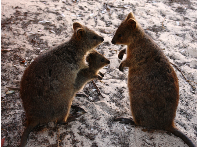
Quokka family in Rottnest Island_

Next up, make a visit to the only metropolis of Western Australia, Perth! Enjoy the wonderful city park, "Kings Park," spreading out over 1.5 square miles and covered with flowers. Here you can also take the ferry from Perth to Rottnest Island, a paradise completely detached from civilization which holds a spiritual significance for Aboriginal Australians. The white sand beaches are teeming with quokkas, a small marsupial that can only be found in this part of Western Australia.